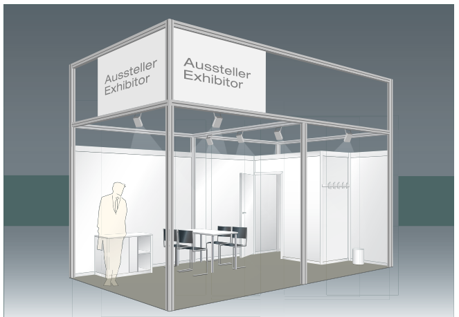
D2 Premium Package, 450.- EUR/m 2 (row stand)