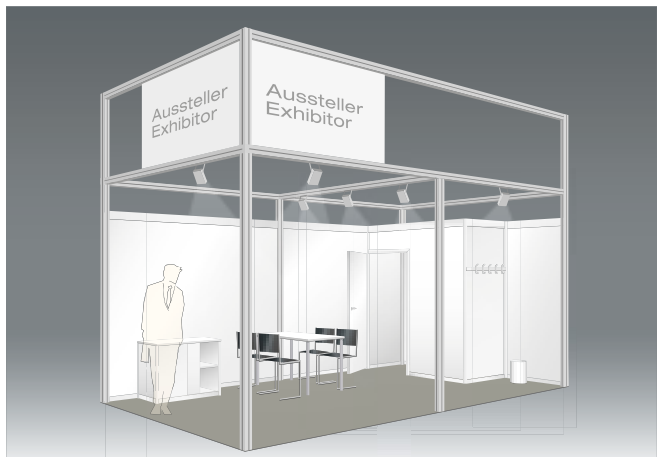
D2 Premium Package, 450.- EUR/m 2 (row stand)